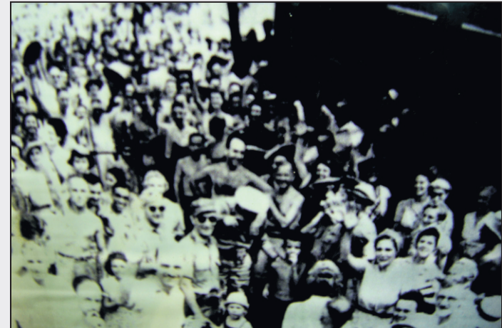
From top: An exterior view of the Weihshien camp. A scout troop at the camp. Internees wave joyfully as the camp is liberated and they are set free.