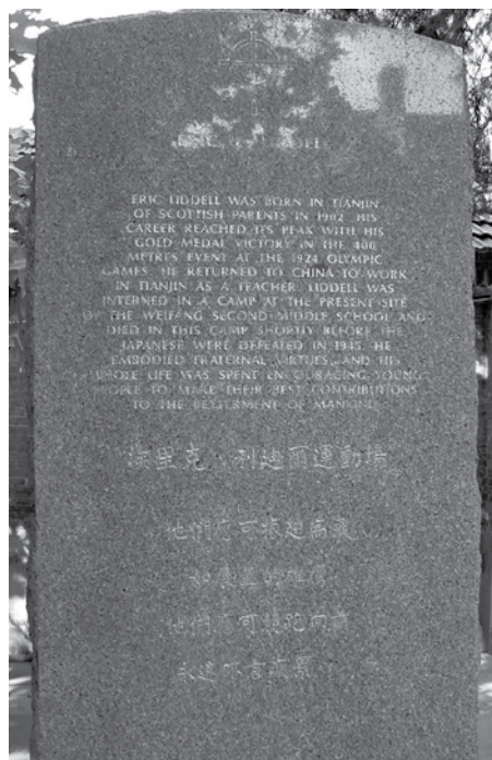
The memorial stone for Eric Liddell. It was presented by the University of Edinburgh in Scotland and has been set in the site of the former Weishein Internment Camp.