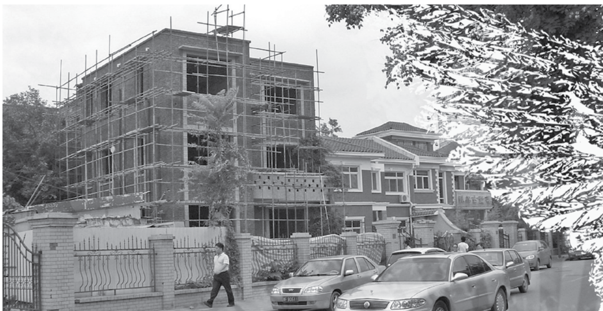
The government invested million dollars to revamp the former residence of Eric Liddell.

The life of Eric Liddell has been an inspiration to millions in the Western world, thanks in part to the recapturing and communicating of his story in film. "The Flying Man" has the opportunity to ex-