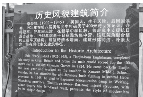
The former residence of Eric Liddell has been one of the Tianjin Historical and Stylistic Architectures, protected by the Government of Tianjin.

may inquire about this by sending an e-mail to: loveinchinacommunications@gmail.com .