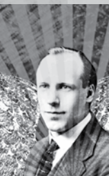
The Flying Man