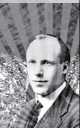
The Flying Man

The China to which Eric returned was suffering from the effects of war, famine and other tragedies. He went to work at the Anglo-Chinese College in Tianjin as a science teacher and became a favorite of his Chinese students.