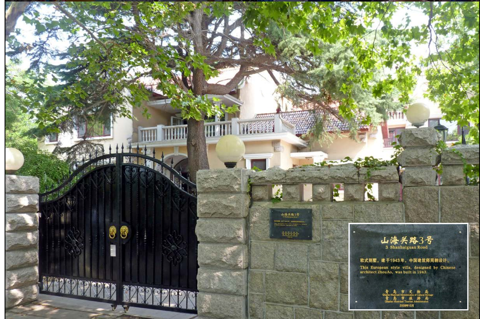
山海关路3号 3 Shanhaiguan Road 欧式别墅，建于1943年，中国建筑师周翥设计。 This European style villa, designed by Chinese architect ZhouAo, was built in 1943. 青岛市文物局 Qingdao Municipal Administration of Cultural Heritage 青岛市旅游局 Qingdao Municipal Tourism Administration 2008年10月