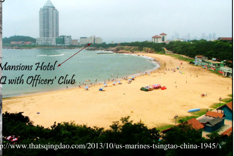
Edgewater Mansions Hotel U.S. Marine BOC with Officers' Club

® http://www.thatsqingdao.com/2013/10/us-marines-tsingtao-china-1945/