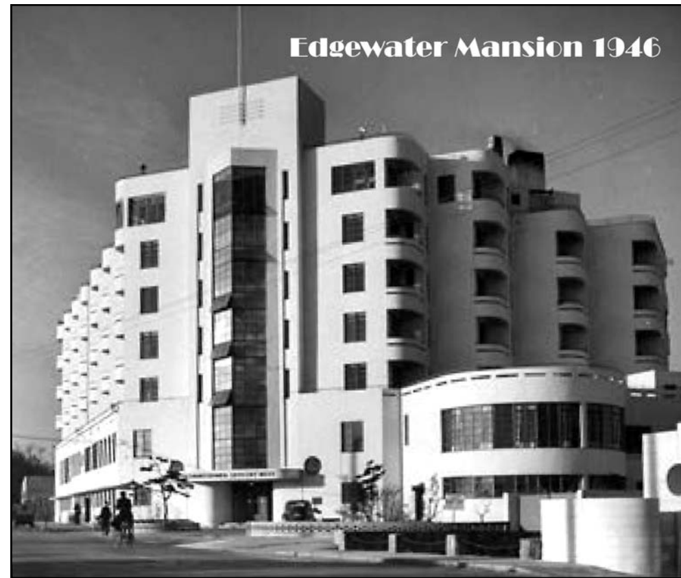
Edgewater Mansion 1946